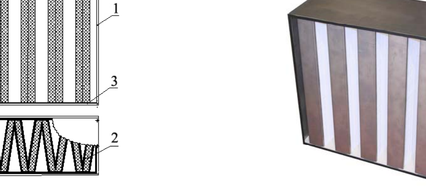
Fig. 1 Scheme of filter HFMF-F